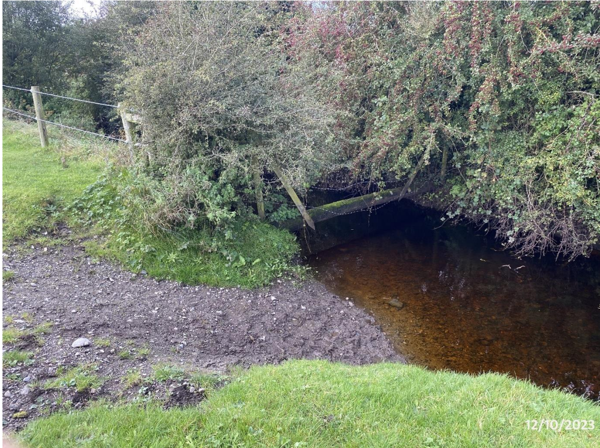
Coill Dubh downstream 1