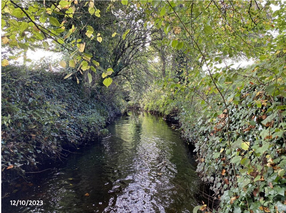
Coill Dubh upstream 2