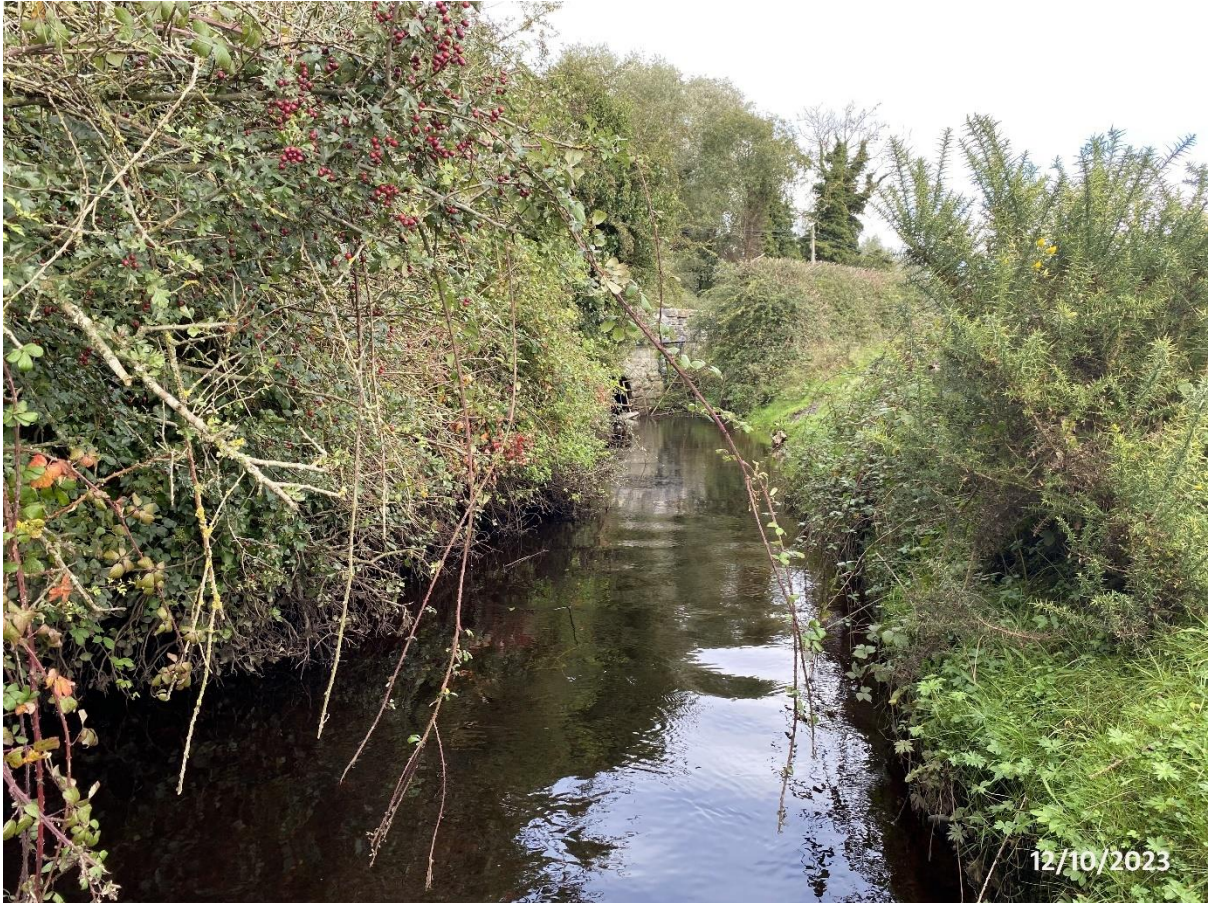
Coill Dubh downstream 2