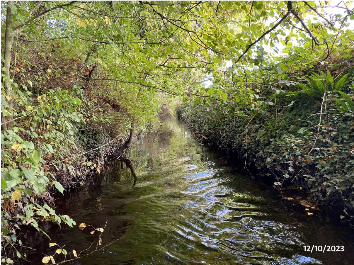
Coill Dubh upstream 1