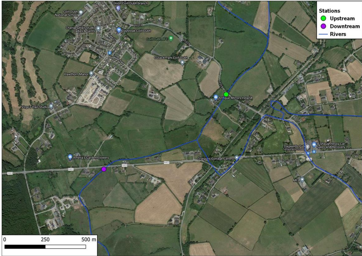
Figure 2.1: Coill Dubh SSRS sampling sites.