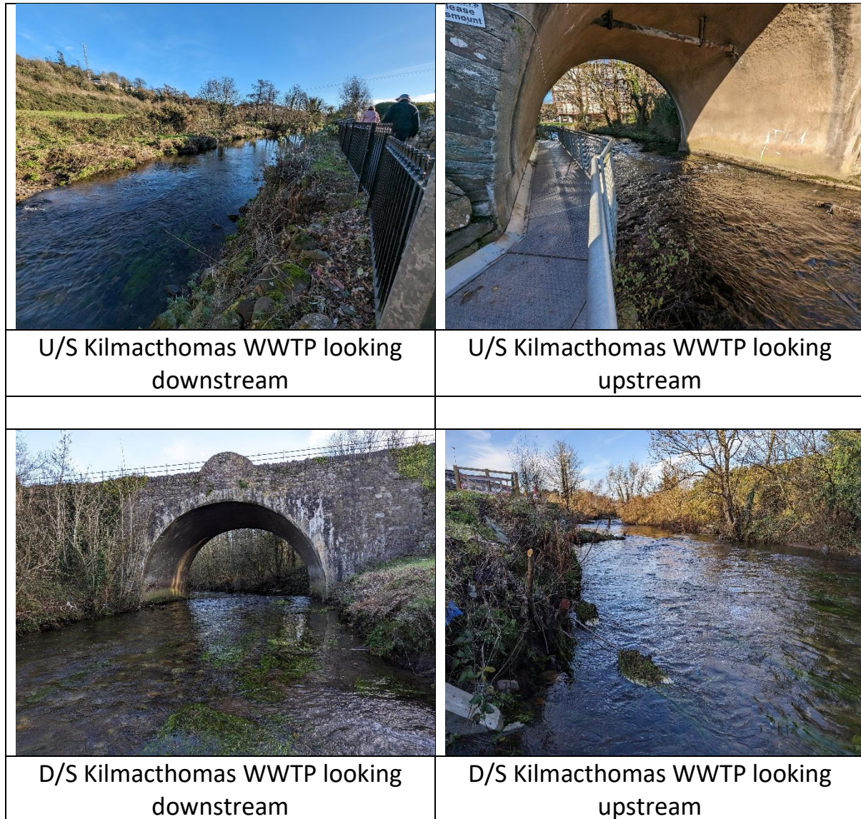
Figure 2. Upstream (U/S) and downstream (D/S) of Kilmacthomas WWTP.

Figure 2 shows photographs taken when sampling at Site 1 and Site 2 upstream and downstream of the Kilmacthomas WWTP on 5 December 2023.