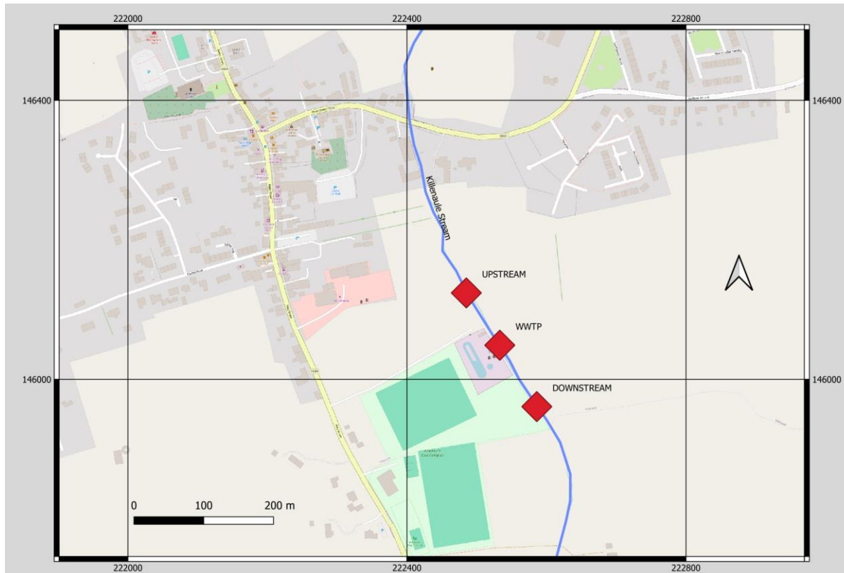
Figure 1. Location of upstream and downstream monitoring sites for Killenaule WWTP. The river flows South.

Figure 1 maps the sampling sites and Table 2 gives the details of the locations sampled.