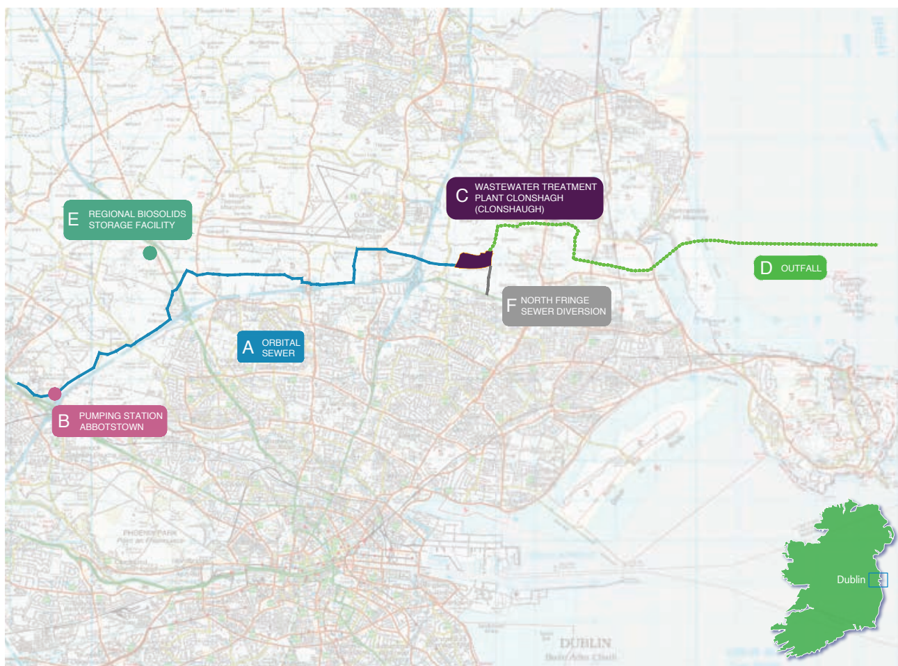
Greater Dublin Drainage Project Solution