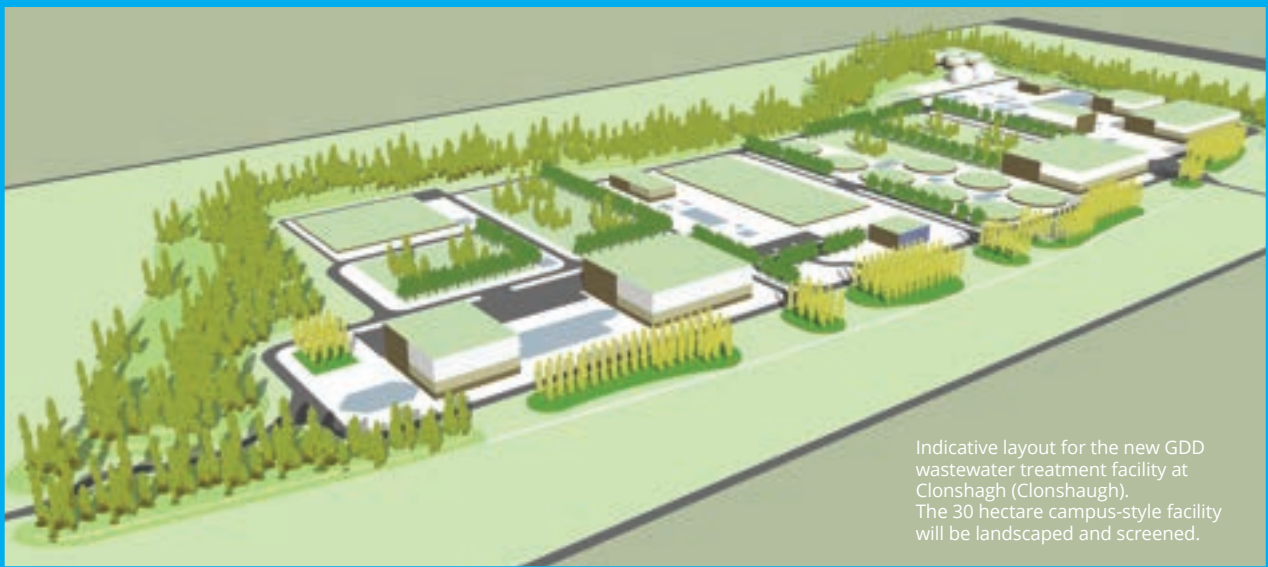
Indicative layout for the new GDD wastewater treatment facility at Clonshaugh (Clonshaugh). The 30 hectare campus-style facility will be landscaped and screened.