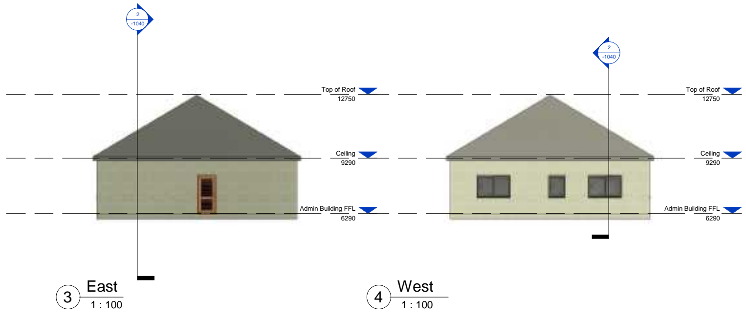
3 East 1 : 100