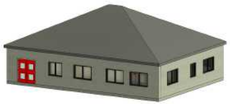
8 3D VIEW -2 ADMIN BUILDING

Copyright This drawing and any design here on is the copyright of the Consultants and must not be reproduced without their written consent. All drawings remain the property of the Consultants. THIS DRAWING TO BE READ IN CONJUNCTION WITH ALL RELEVANT ARCHITECTS AND ENGINEERS DRAWINGS. FIGURED DIMENSIONS ONLY TO BE TAKEN FROM THIS DRAWING. ALL LEVELS ARE IN METRES AND RELATE TO DATUM AT MALIN HEAD. THIS DRAWING IS REPRODUCED FROM DIGITAL MAPS: O.S. MAPS - Scale 1:2,500 O.S. MAPS - Scale 1:1,000 DISCOVERY SERIES - Scale 1:50,000 ALL MAPS ARE REFERENCED TO IRISH NATIONAL GRID (I.T.M.) REPRODUCED FROM THE ORDNANCE SURVEY OF IRELAND BY PERMISSION OF THE GOVERNMENT. LICENSE NO. 3-3-34. THIS DRAWING IS A COPY OF AN ELECTRONIC FILE AND IS COPYRIGHT. ALL DIMENSIONS TO BE CHECKED ON SITE. ALL MATERIALS AND WORKMANSHIP TO BE IN ACCORDANCE WITH ENGINEERS SPECIFICATION. IT IS THE CONTRACTORS RESPONSIBILITY TO VERIFY ALL DIMENSIONS AND LEVELS PRIOR TO COMMENCEMENT OF CONSTRUCTION.