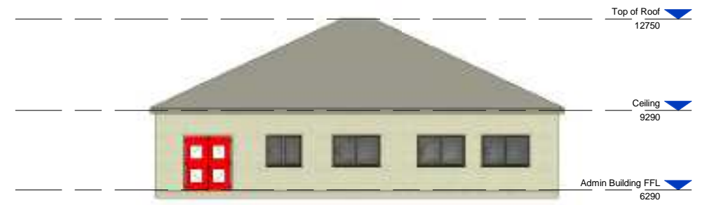
5 North 1 : 100