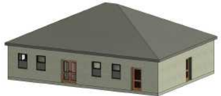
7 3D VIEW -1 ADMIN BUILDING