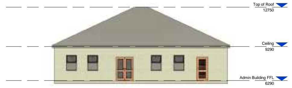
6 South 1 : 100