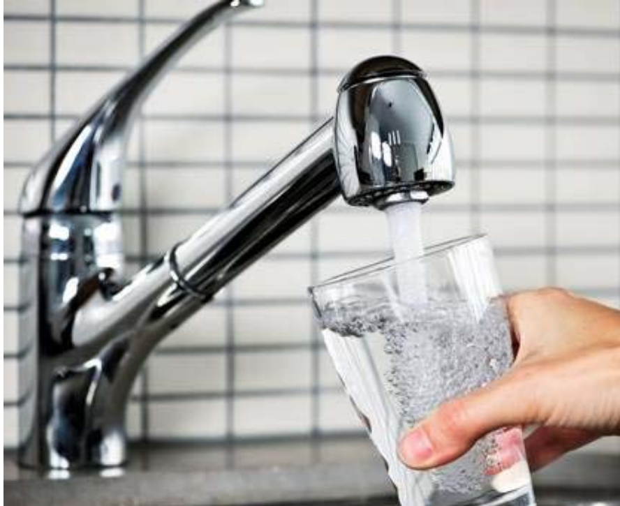
Open Gallery 1

Irish Water could use sludge produced by wastewater treatment plants as fuel to power incinerators and produce electricity